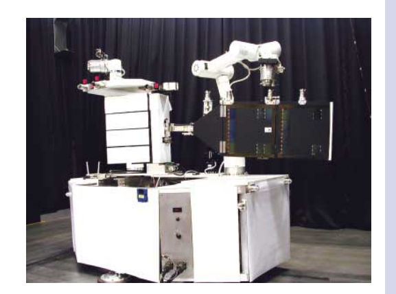
A Space Maintenance Robot on a Test Bed

The Space Maintenance Robot is a robotization of space system, which allows the assembly of several micro satellites in orbit, as well as the capture of orbiting satellites for diagnosis, maintenance and supply. Also, it is used for recovering and disposal of satellites at the end of the mission, helping the preservation of the space environment and contributing to the reliability and increasing life span of space infrastructure composed of micro satellites. This multifunctional space robot will provide care from the cradle to the grave for the satellite constellation.