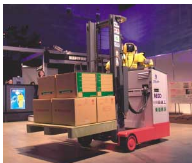
Teleoperated humanoid robot drives a lift truck

cations and do also incidental tasks instead of the human.