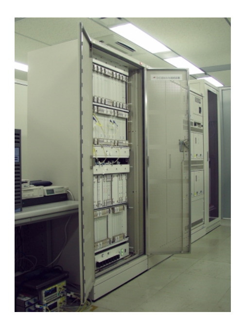
Tsukuba WAN AIST NODE (located at TACC)

The Information Technology Research Institute at the National Institute of Advanced Industrial Science and Technology (AIST) has used an improved version of GLOBUS software, developed through joint research with NEC Corporation, and achieved the first ever operation of a supercomputer via a high-speed network. The GLOBUS is a highly rated grid middleware originally having developed by USC's Information Science Institute (ISI) and Argonne National Laboratory. In the research, the supercomputer at the Telecommunications Advancement Organization of Japan Tsukuba Gigabit Laboratory and an AIST computer were connected via the Tsukuba WAN high-speed network. The Gigabit Laboratory supercomputer was then successfully operated by the AIST computer.