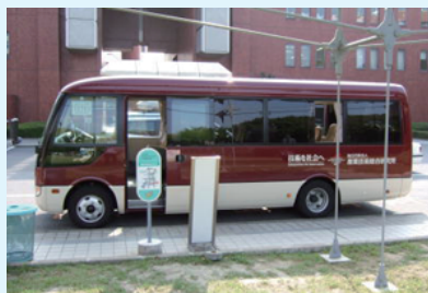
Logo marks on the AIST shuttle buses