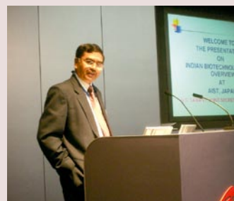
Lecture by DBT Joint Secretary N.S. Samant

research cooperation. As a result, the structural difference between DBT, a government ministry, and AIST, a research institution, was confirmed, and specific collaborative research themes related to bioinformatics were also suggested. Hereafter, it was agreed, interaction among researchers will be promoted and individual collaborative research themes will be launched under the MOU.