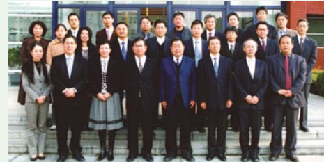
Participants from both countries that attended the workshop

research institutes affiliated to CAS, mainly DICP, on the Chinese side, and by AIST, NEDO, and universities on the Japanese side; and active discussions were held. On the last day, there was a lab tour of DICP, and much information on the Chinese situation concerning the relevant areas was obtained.