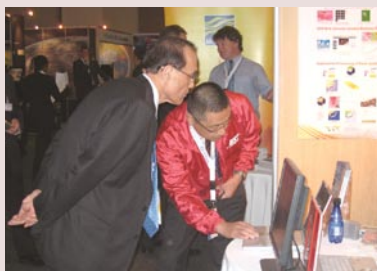
Then GTRC Director Sekiguchi explaining GEO Grid to MEXT Minister Tokai

The Fourth Earth Observation Summit, sponsored by Group on Earth Observations (GEO), was held from November 28 to 30, 2007 at Cape Town. Representatives of over 100 member governments and international organizations discussed climate change by global warming as well as the construction of an international monitoring system against natural disasters, and Cape Town Declaration which advocates strengthening of