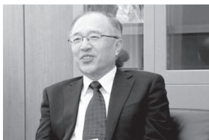
Dr. Akira Ono

The problem was what do you do when the plant undergoes unexpected failure. It can not be fixed by computers and it has to be done by persons. If we all depend upon automation only, we overlook training our operators for such cases. To control the plant during emergency, the basic policy is "stopping" it, but it has to be stopped safely. Accurate decision can not be made if the operators are not trained for such non-computer-controlled emergencies. We learned that the emergency training must be done separately while working on automation.