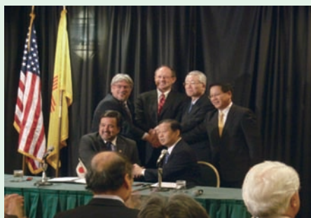
Signing of the memorandum between METI and the state of New Mexico

In research cooperation, around 20 AIST researchers will be sent to the US this fiscal year, and we intend to establish a collaborative research base for smooth cooperative activities such as joint research and exchange of researchers.