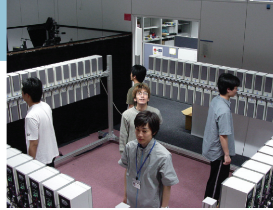
Photo: 128ch Microphone arrays allow five people to each listen to a different sound

Sounds pass through air at about 340 m/s. Therefore, with many sound devices placed in that air, the time every sound reaches each device varies depending on the distance from the focus. Knowing and using this fact, it is possible to select one sound and intensify it specifically by setting a sound focus at one location and adding the time