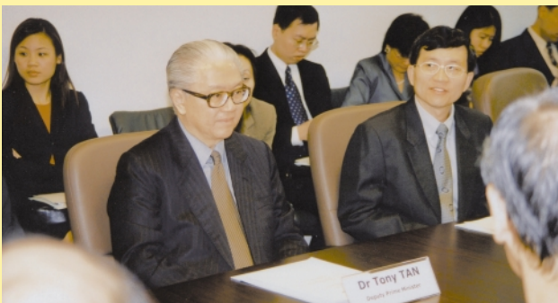
Dr. Tony Tan Singapore, Dupty Prime Minister September 9, 2001.