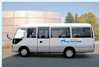
Logo marks on the AIST/NIMS shuttle buses