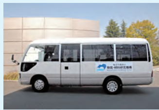
Logo marks on the AIST/NIMS shuttle buses