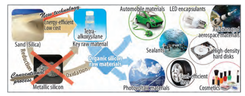
Manufacture of organic silicon raw materials from sand and diverse product groups containing organic silicon

Tetraalkoxysilane is a key raw material of the silicon chemical industry and a promising raw material for silicone and other various organic silicon materials. We developed a technology capable of efficiently synthesizing tetraalkoxysilane through a one-step reaction between alcohol and silica, the primary constituent of sand. We discovered that tetraalkoxysilane could be obtained in one step by adding an organic dehydrating agent to the reaction system of silica and alcohol to remove the water by-product. Also, the efficiency of the reaction was further increased by performing it in the presence of carbon dioxide and catalysts, metal alkoxide and alkali metal hydride. This technology paves a new path to the energy-efficient, low-cost manufacture of organic silicon raw materials from sand.