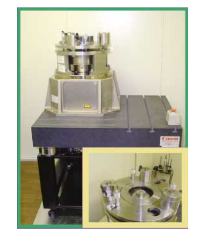
Automatic high precision calibration system for rotary encoder

We developed the automatic calibration system for angle encoders. The system uses the Equal-Division-Averaged method that is one kind of the self-checking method. Both of the reference standard and the object angle encoders are calibrated at the same time against all encoders graduations within only one hour. The resolution and an uncertainty are 0.001 " and approximately \pm 0.05 ", respectively. This Equal-Division-Averaged method is hoped to become the national standard method for the calibration of angle encoders.