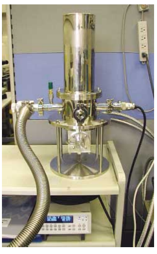
A photograph of a desktop Josephson voltage standard system

A prototype of a desktop Josephson voltage standard system with a compact refrigerator has been developed. The performance of the prototype system was evaluated by measuring current-voltage( I-V ) characteristics for NbN/TiNx/NbN junction arrays cooled in the system supplied with a microwave(16 GHz). As a result, constant-voltage steps with amplitudes greater than 1 mA were observed on the I-V characteristics, indicating that the system was normally operated. The highest output voltage for the developed system is 1 V. We have a plan to increase it up to 10 V in near future.