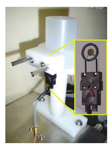
The appearance of quartz crystal microbalance and measurement cell

The simple and continuous monitoring method of volatile chloroorganic compounds using quartz crystal microbalance (QCM) was developed. The selectivity was improved, when the surface of the detector was covered by the lipid with the characteristic adsorption function. The reversible response which dealt with increase and decrease of the concentration was obtained. And this sensor has the wide dynamic range (0 to 1000 ppm). So, by using this method, the application to continuous monitoring and working environment measurement can be expected.